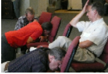
PASTORS IN PRAYER