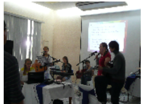
MK's leading in worship