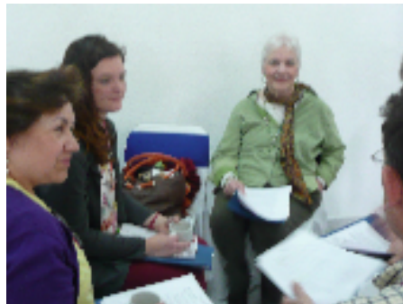
Sharing in small groups