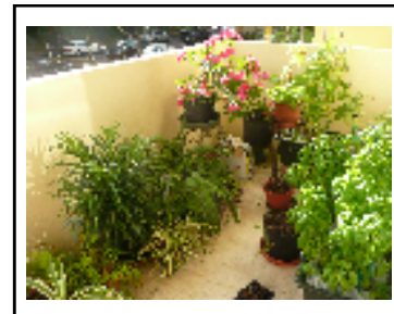
Florida crops from November to April